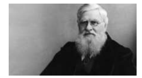
Alfred Russel Wallace