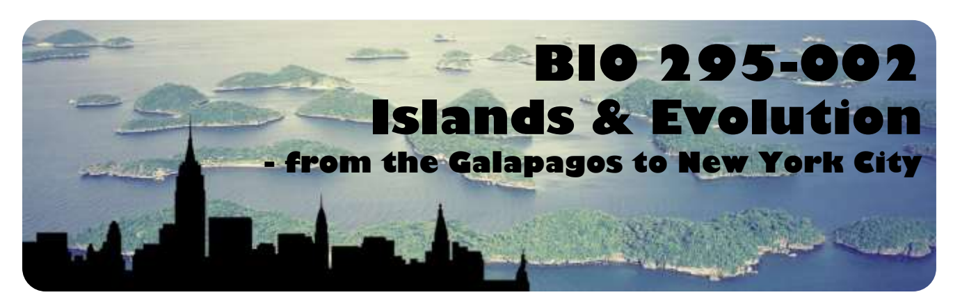
Spring 2014: Mondays 10:15am – 12:05pm (Fox Hall, Room 204)

http://theantlife.com/teaching/bio295-islands-evolution