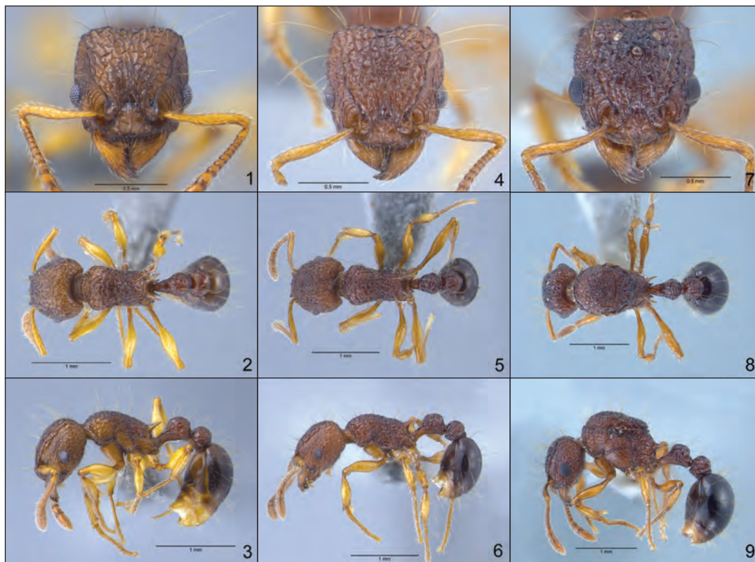
Figs. 1–3. Tetramorium flagellatum , worker (ABNC): (1) Head, full-face view. (2) Habitus, dorsal view. (3) Habitus, lateral view.